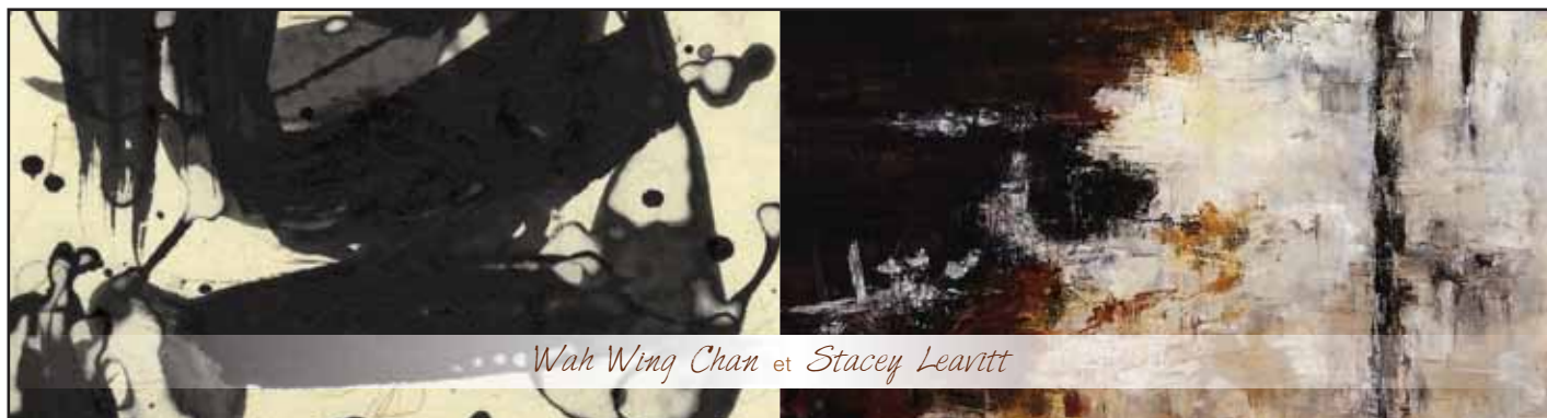
Wah Wing Chan et Stacey Leavitt

For reservations call 519 271-5052 stratfordsummermusic.ca