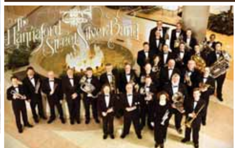
Hannaford Street Silver Band

Classical music and so much more! Bien plus que de la musique classique!