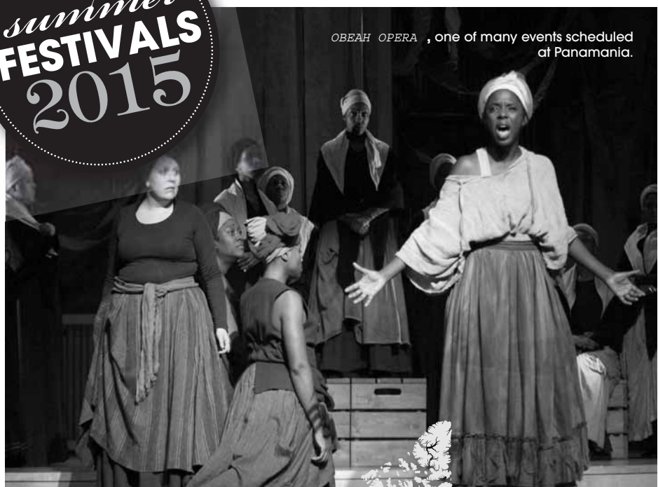
OBEAH OPERA, one of many events scheduled at Panamania.