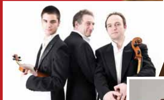
Vienna Piano Trio